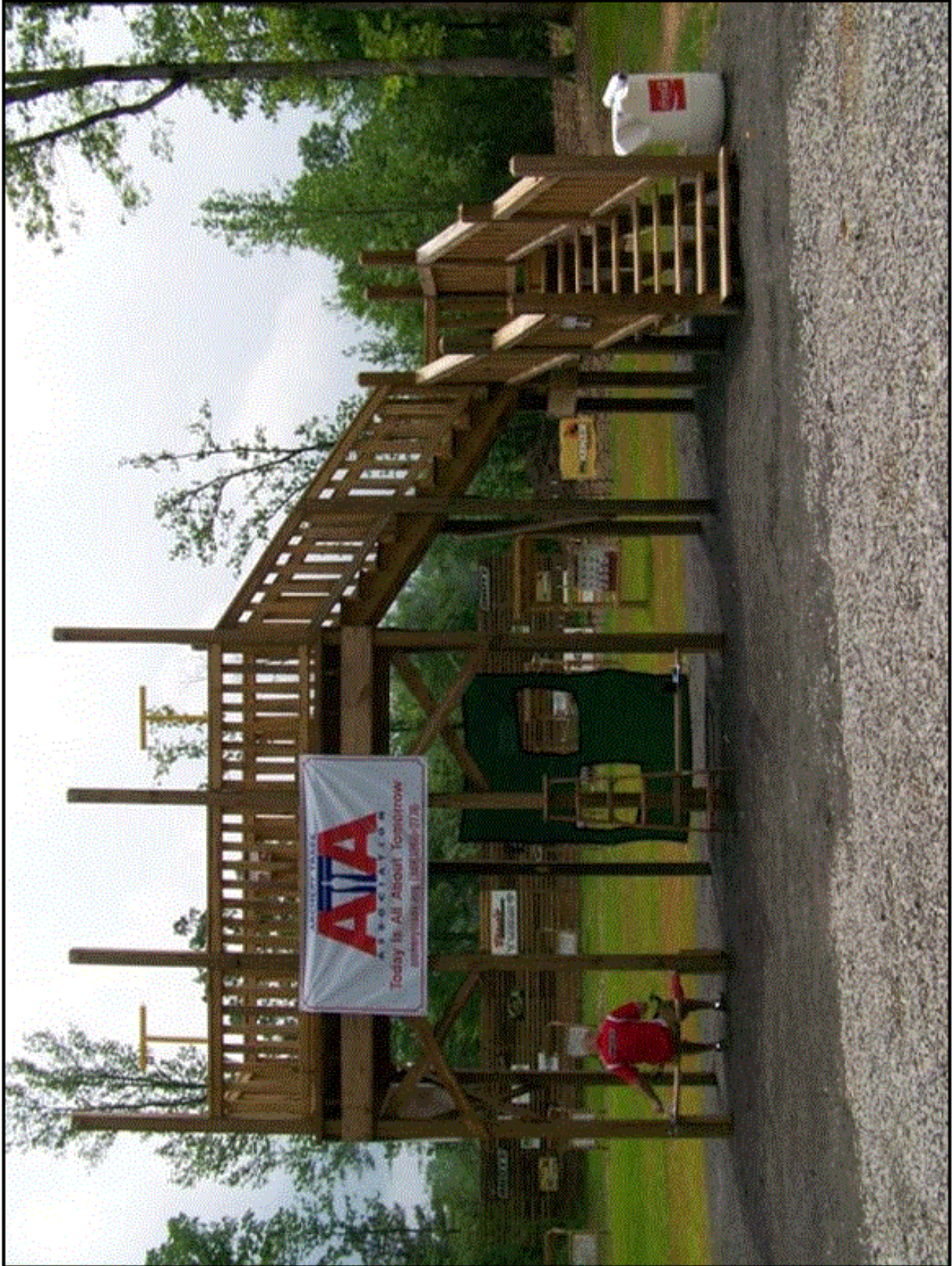
Example #2 of Shooting Structure