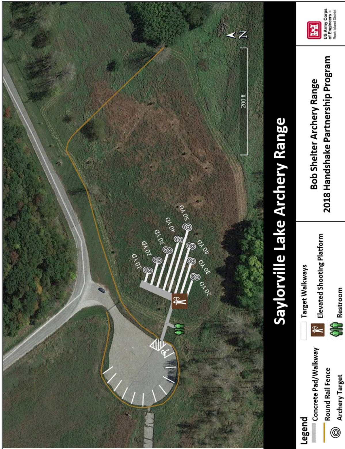
Aerial View of Proposed Site